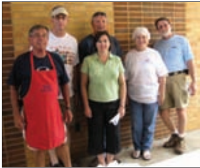
The AT&T Pioneers provided a Memorial Day cookout for the children & staff.