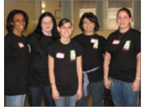
Kohl's Department Store's A-Team provided a morning of fun, fellowship and a $500.00 donation for the children