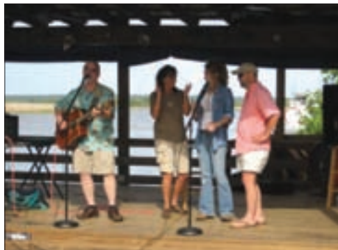
Musicians performing at the Blue Gill Concert for the Children

The event was a great success for our first special event. All of the musicians donated their time; the Blue Gill