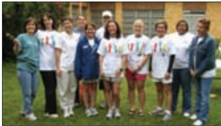
Volunteers from Junior League of Mobile's First Annual Hands Across Mobile, worked with the older children to refurbish our board room.