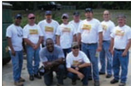
United Way of Southwest Alabama's Annual Day of Caring provided helpful, hard working volunteers from Williams Company, Kemira, BankTrust, Thompson Engineering and Mobile Works .