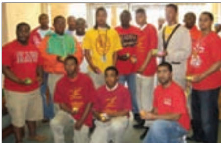
Kappa Alpha Psi with the Kappa League sponsored an Easter Egg Hunt for the children.